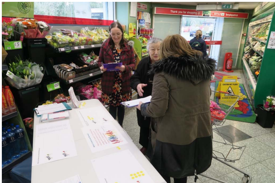
Spar Store, Templepatrick

Interestingly, after talking with us and hearing more about Community Planning the majority of people (96%) thought that it was important to have opportunities to get involved in the process in their area.