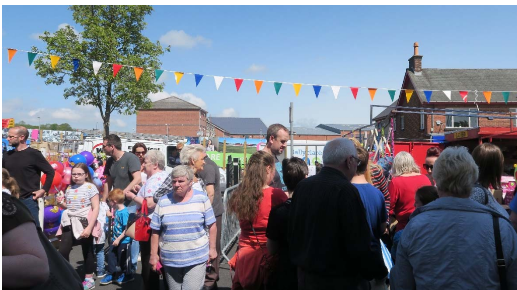
Ballyclare May Fair